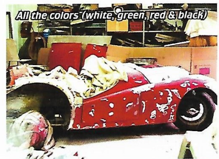
All the colors (white, green, red & black)

Although I couldn't get into the serious thick of things, there were still plenty of places and events to have that blast. There is never a summer without a trip to Watkins Glen, and the many great track venues that make the TR a familiar face. Lime Rock, Put-In-Bay, Pittsburgh Vintage, VTR in the Blue Ridge and on and on.