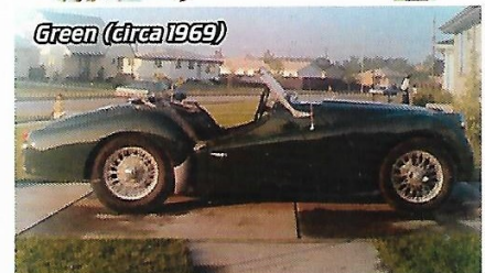
Green (circa 1969)