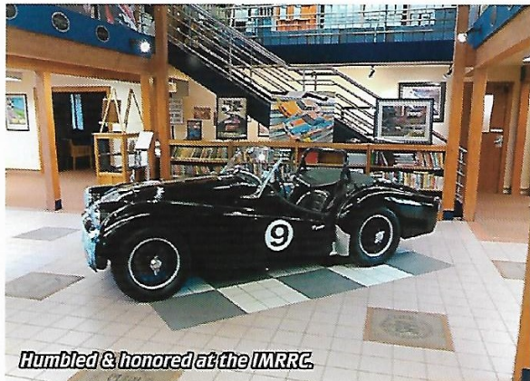
Humbled & honored at the IMRRC.