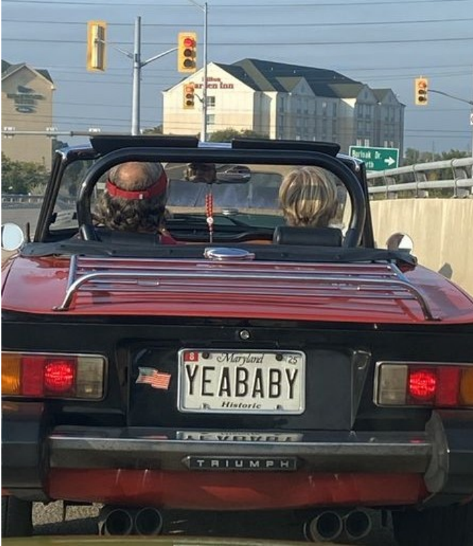
Participants in the Six-Pack TRials 2024 came in from far and wide! Yeah, Baby!

See our Facebook page to exchange news, events, information, photos and humor at